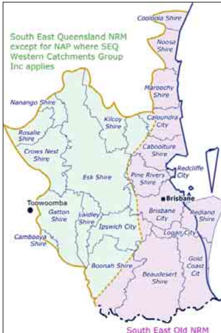
Figure 2: South East Queensland NRM region showing local government areas

Figure 2 above shows a map of the South East Queensland NRM region. For the South East Queensland NRM region 286 statistical local areas fall wholly within the boundary of the region and 24 partially. We had to assume that agricultural production is spread uniformly over the statistical local area, and agricultural production has been allocated to regional NRM bodies on this basis. Where less than 10% of a statistical local area fell within the region, however, the data from this statistical local area was not included. Where more than 90% of the statistical local area fell within the region, 100% of the data from this statistical local area was included. Table 1 below shows the statistical local areas that are partially contained within the region and indicates the percentage of each one that has been included within the boundaries of the region for the purpose of this report. Table 1 also shows where a statistical local area has been added or subtracted. Appendix 1 contains the names of the other statistical local areas that fall wholly within the South East Queensland NRM region.