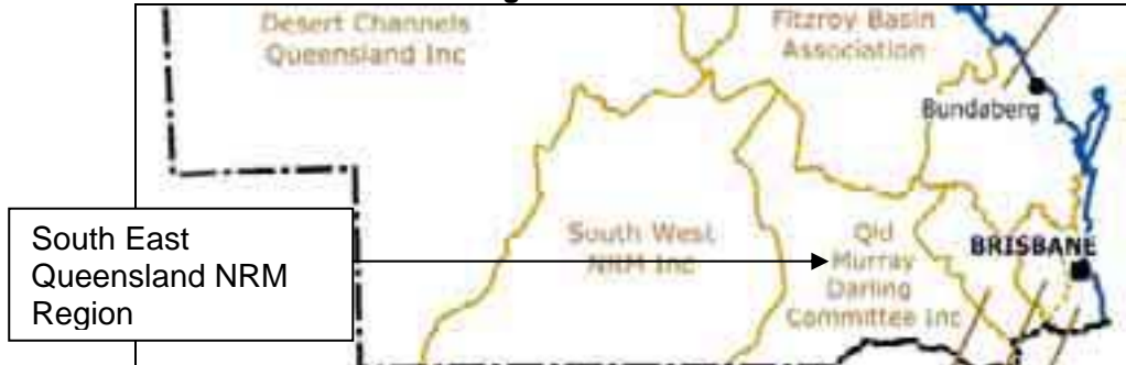
Figure 1: South East Queensland NRM region

The South East Queensland Western Catchments includes the Stanley and Upper Brisbane Catchments, the Lockyer Catchment, and the Bremer and Mid Brisbane Catchments (see figure 1 below).