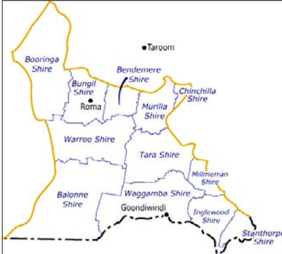
Figure 2: Queensland Murray Darling NRM region showing each local government area

Figure 2 above shows the local government areas contained within the Queensland Murray Darling NRM region. These local government areas contain two statistical local areas which fall wholly within the boundary of the region and twelve partially (see Table 1). We had to assume that agricultural production is spread uniformly over the statistical local area, and agricultural production has been allocated to regional NRM bodies on this basis. Where less than 10% of a statistical local area fell within the region, however, the data from this statistical local area was not included. Where more than 90% of the statistical local area fell within the region, 100% of the data from this statistical local area was included. Table 1 below shows the statistical local areas that are contained within the region and indicates the percentage of each one that has been included within the boundaries of the region for the purpose of this report. Table 1 also shows where a statistical local area has been added or subtracted.